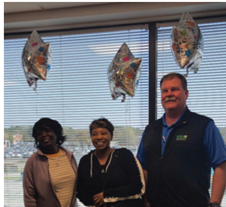
Our April Birthday Celebration