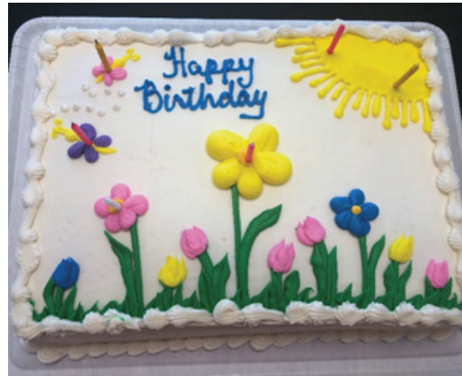
Celebrating March Birthdays